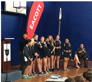
Yr 7 Netball Team Winners

Once again it has been a busy and productive term for teachers and students at the Tindale Campus. We have recognised and celebrated the achievements of our students along the way, especially at our Awards Assembly in week 3 where we acknowledged outstanding performances by our athletes at both the school and interschool athletics carnivals and successful campaigns by our Netball teams in the Multicultural Carnival; congratulations to the Year 7 team who won their division!